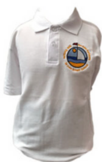
St. Ives Infant School White Polo Shirt