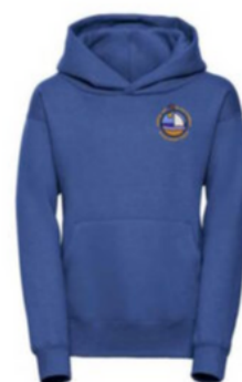
St. Ives Infant School Hoodie