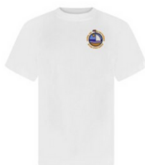
St. Ives Infant School PE T- Shirt