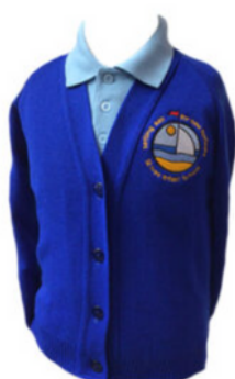
St. Ives Infant School Cardigan