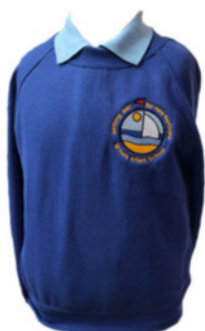
St. Ives Infant School Sweatshirt