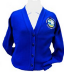
St. Ives Infant School Cardigan