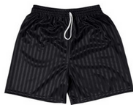
Black PE Shorts