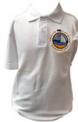
St. Ives Infant School White Polo Shirt