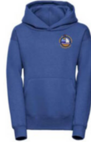
St. Ives Infant School Hoodie