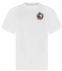
St. Ives Infant School PE T- Shirt