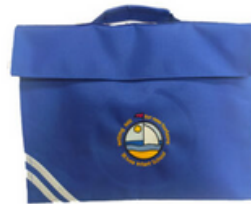
St. Ives Infant School Bookbag