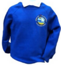
St. Ives Infant School Sweatshirt