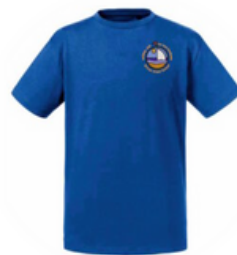
St. Ives Infant School Nursery T-Shirt